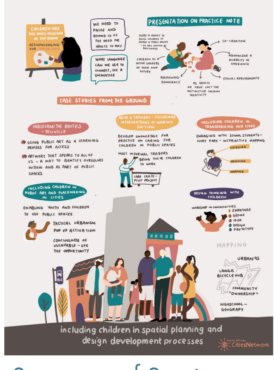
Summary of Session