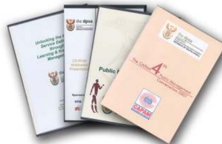
Annual Public Management Conversation (DVD)