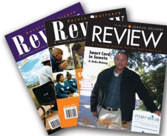
Service Delivery Review - A learning journal for Public Service Managers (Journal)