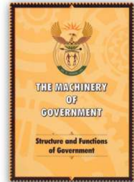
Machinery of Government (Publication)