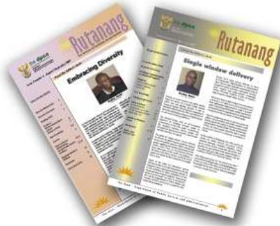
Rutanang (DPSA Internal Newsletter)