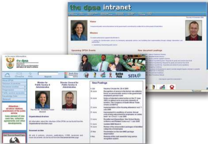
Internet and Intranet (Web)